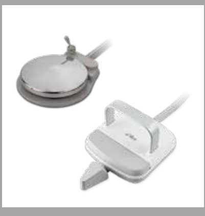
Disc or Lever foot control