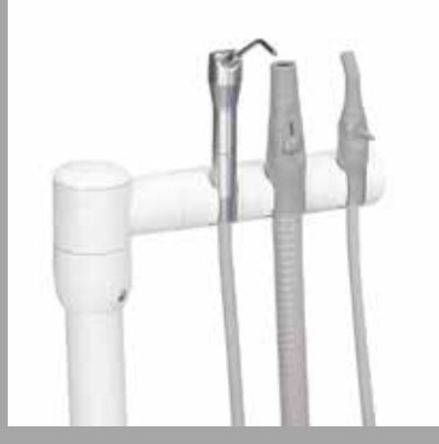
Assistant's 3-position holder with Durr HVE, saliva ejector switched holders and optional syringe