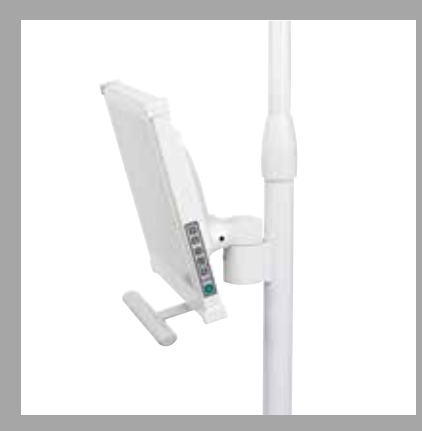
Monitor mount available