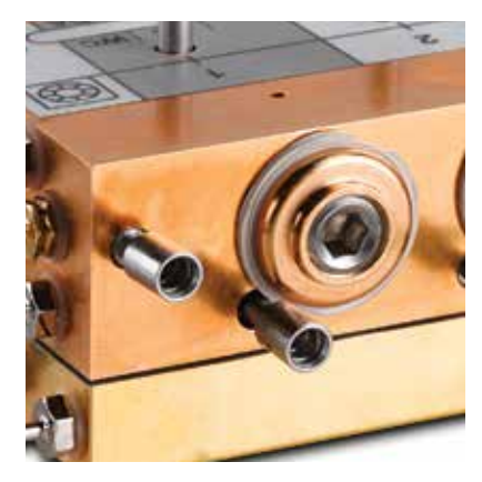
Control block – Patented design promotes clean treatment water with every activation.

peace of mind that comes with A-dec's five-year warranty. It's all part of what makes A-dec, A-dec.