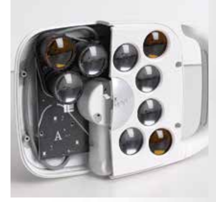
A-dec LED light – Award-winning silent design incorporates unique "passive cooling" to dissipate heat without a fan.