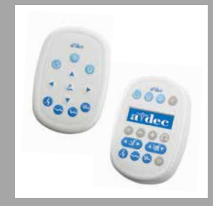
Standard or Deluxe touchpad