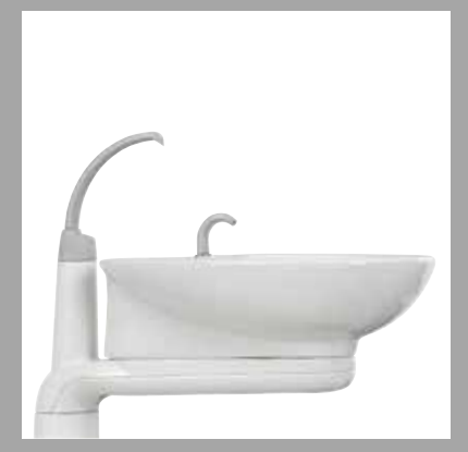
Rotating vitreous china cuspidor available