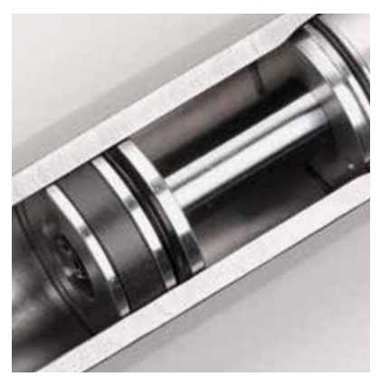
Lift cylinder – A-dec built and engineered with robust hydraulics and fewer parts.