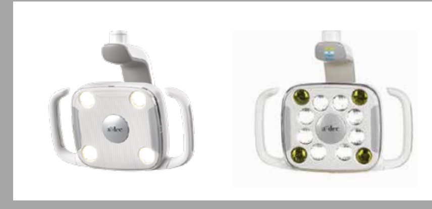
A-dec 300 LED