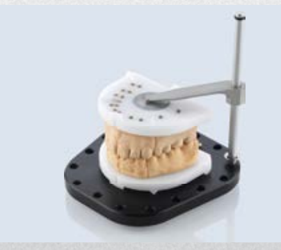
_Universal carrier plate for flexible scanning of a host of different model systems _Maximum flexibility for the user