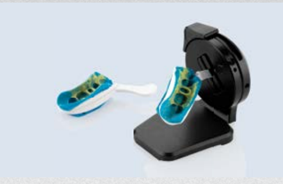
_Fully automated workflow for scanning impressions _No manual intervention necessary _Easy handling